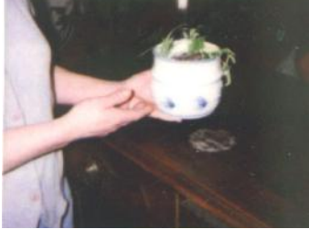
White Water Marks?