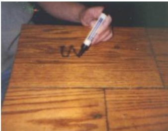
Magic Marker & Ink Stains?